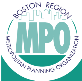
Figure A.1 Notice of Nondiscrimination