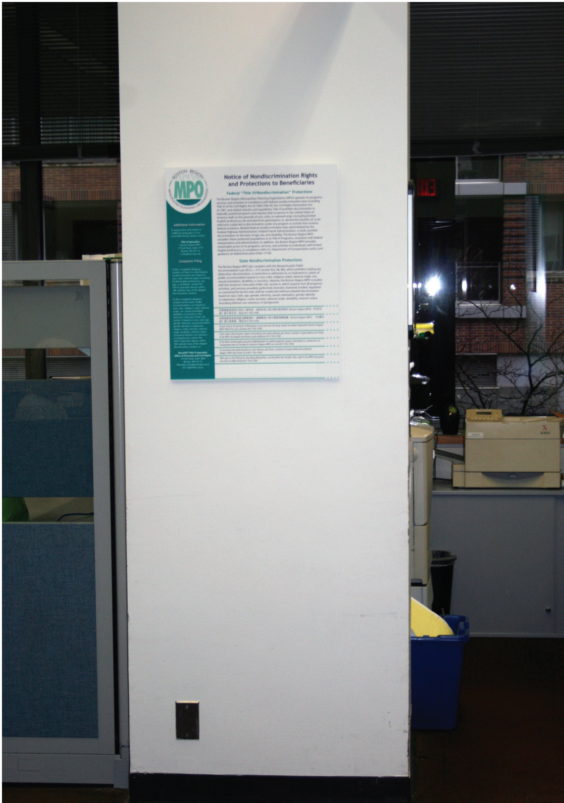
Figure A.2 Notice of Nondiscrimination at MPO Office Entrance and MPO Meetings